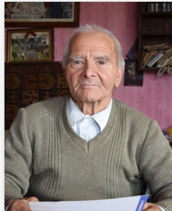
The war veteran from whom the personal story comes