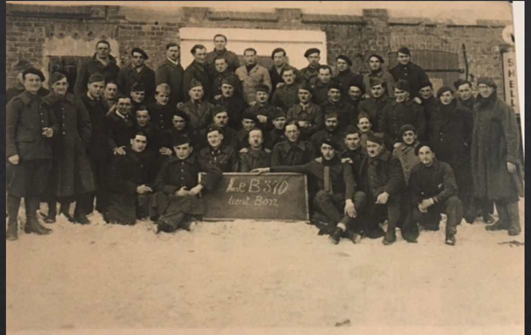
Annex 2: Postcard sent from stalag II-A